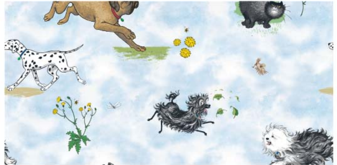
HAIRY MACLARY (SOLID) MULTI