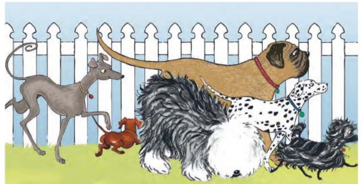
WALKOUT (SHEER) MULTI